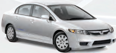
2011 Honda Civic

Receive a Gift when you visit: www.JohnSmith.buymyHonda.us