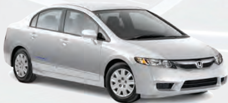
2011 Honda Civic

Receive a Gift when you visit: www.JohnSmith.buymyHonda.us