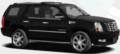
2011 Cadillac Escalade

Receive a Gift when you visit: www.JohnSmith.buymyCadillac.us